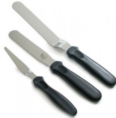
Metal, rounded spatula